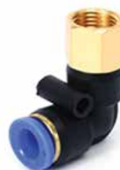
CODO ROSCA MACHO HEMBRA MANGUERA